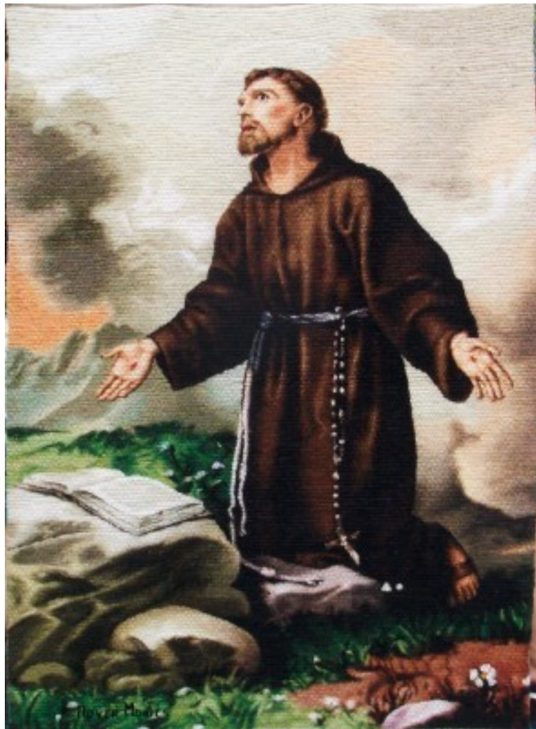
San Francesco D'Assisi

Say Thanks to your guides, The Universe and San Francesco D'Assisi for this gift from heaven.