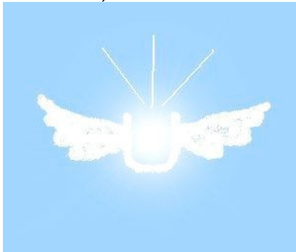
Spirit Steed Symbol 2

Below is the symbol for traveling through time and space to the past of this life, or to the future.